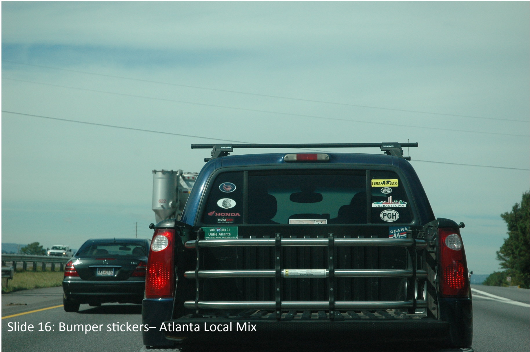
Slide 16: Bumper stickers– Atlanta Local Mix