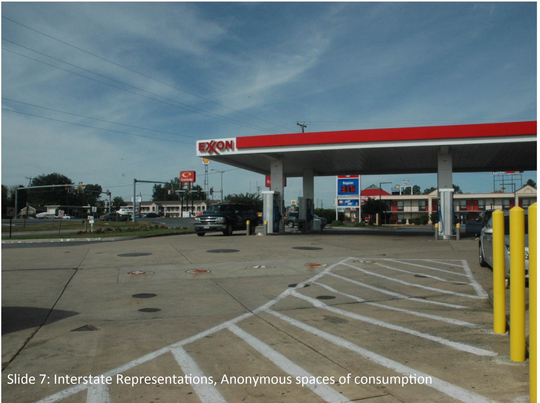
Slide 7: Interstate Representations, Anonymous spaces of consumption