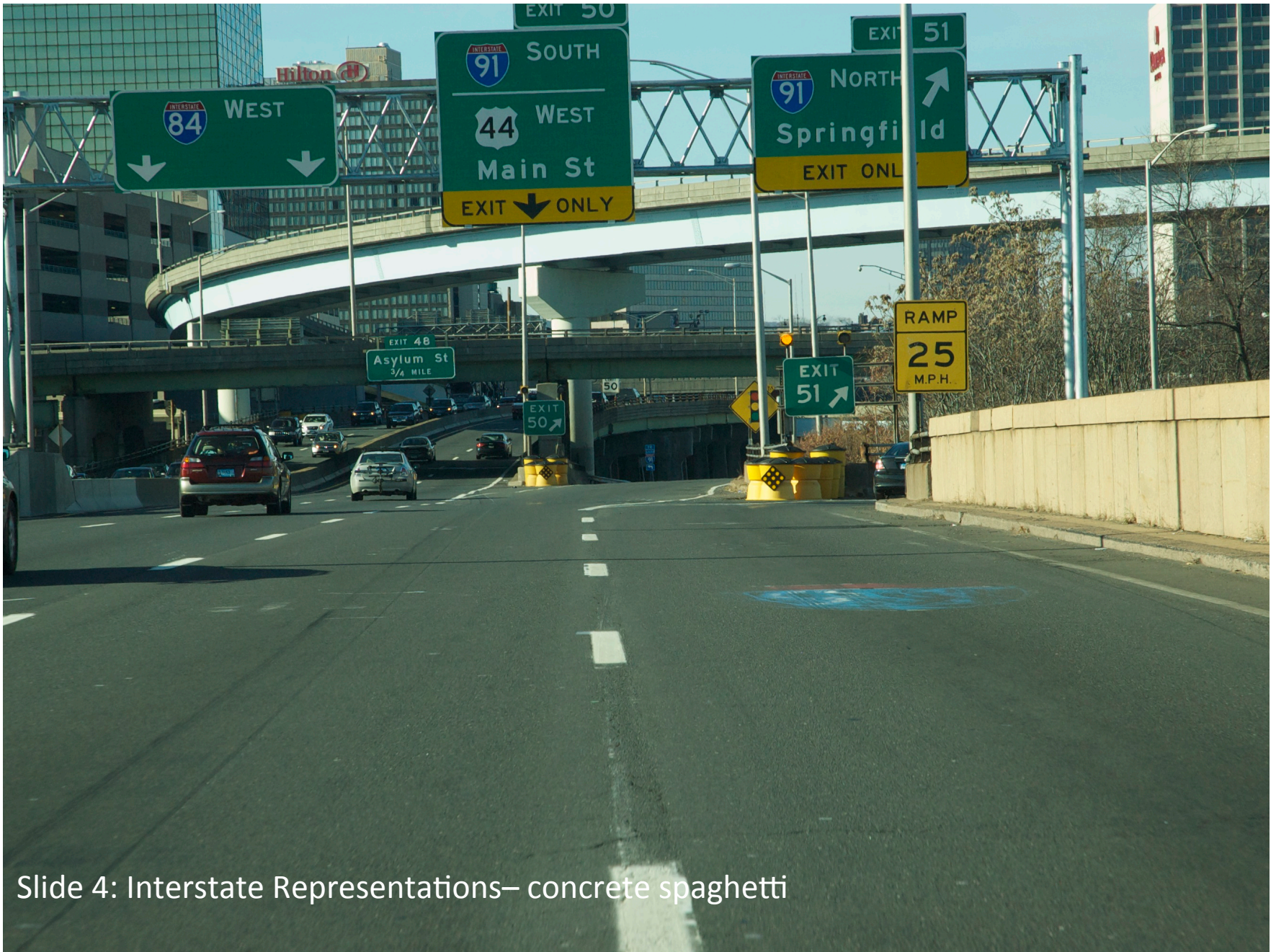
Slide 4: Interstate Representations— concrete spaghetti