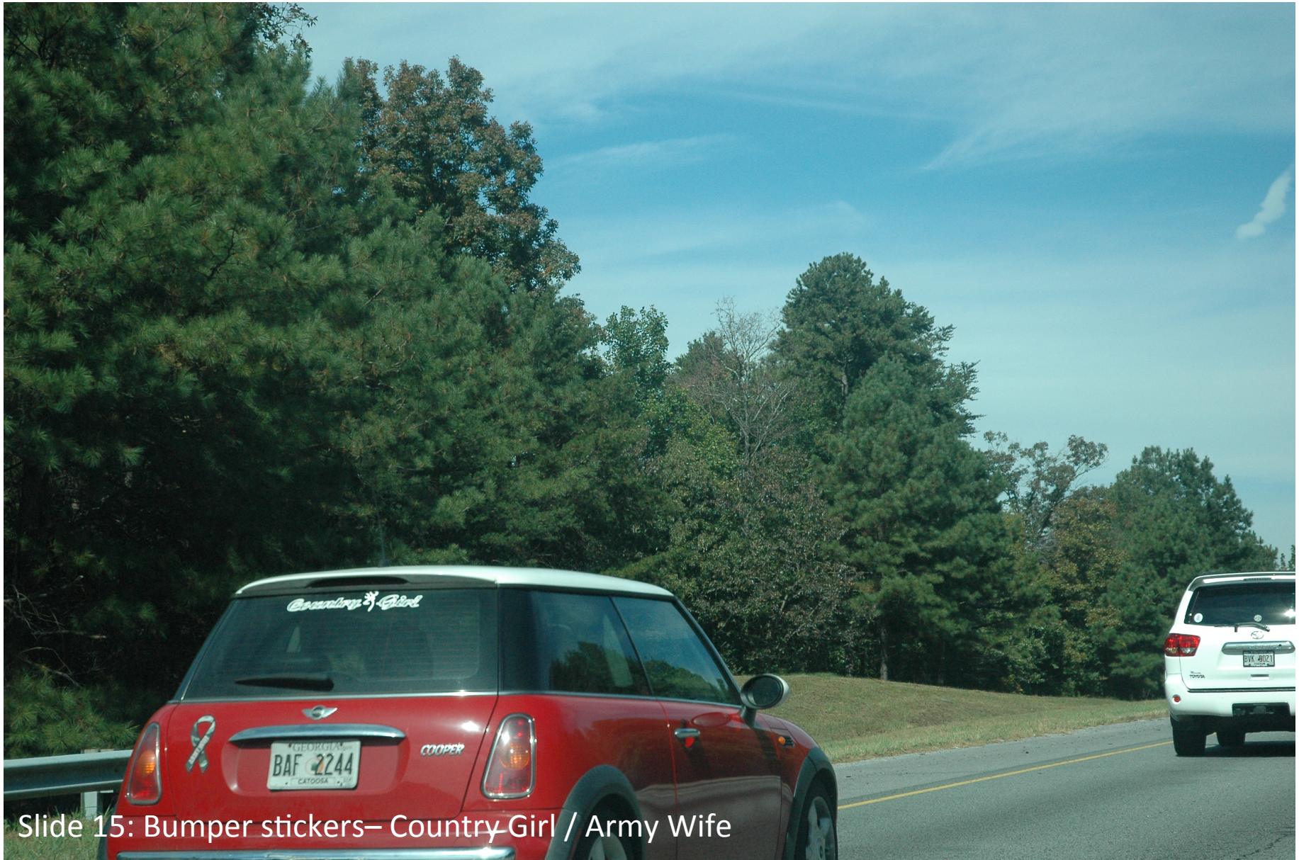
Slide 15: Bumper stickers– Country-Girl / Army Wife