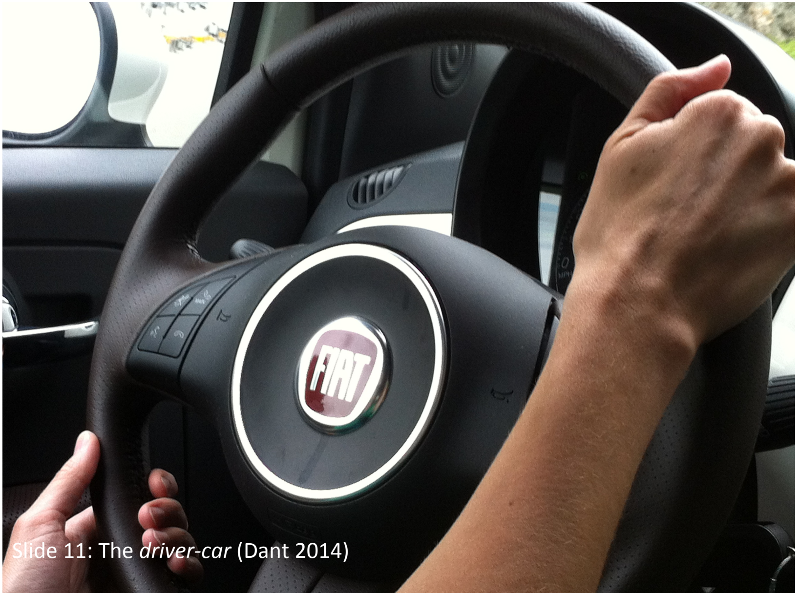
Slide 11: The driver-car (Dant 2014)