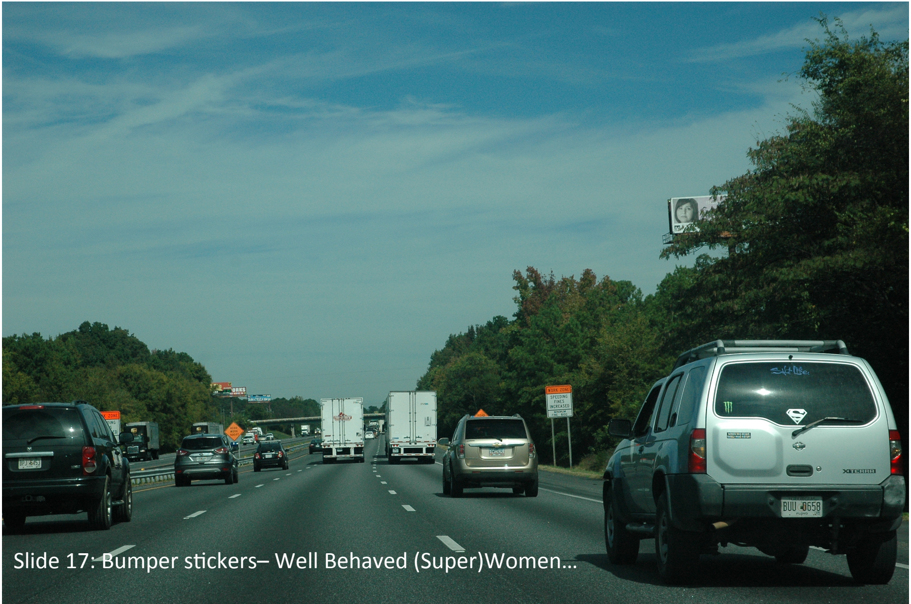
Slide 17: Bumper stickers– Well Behaved (Super)Women...