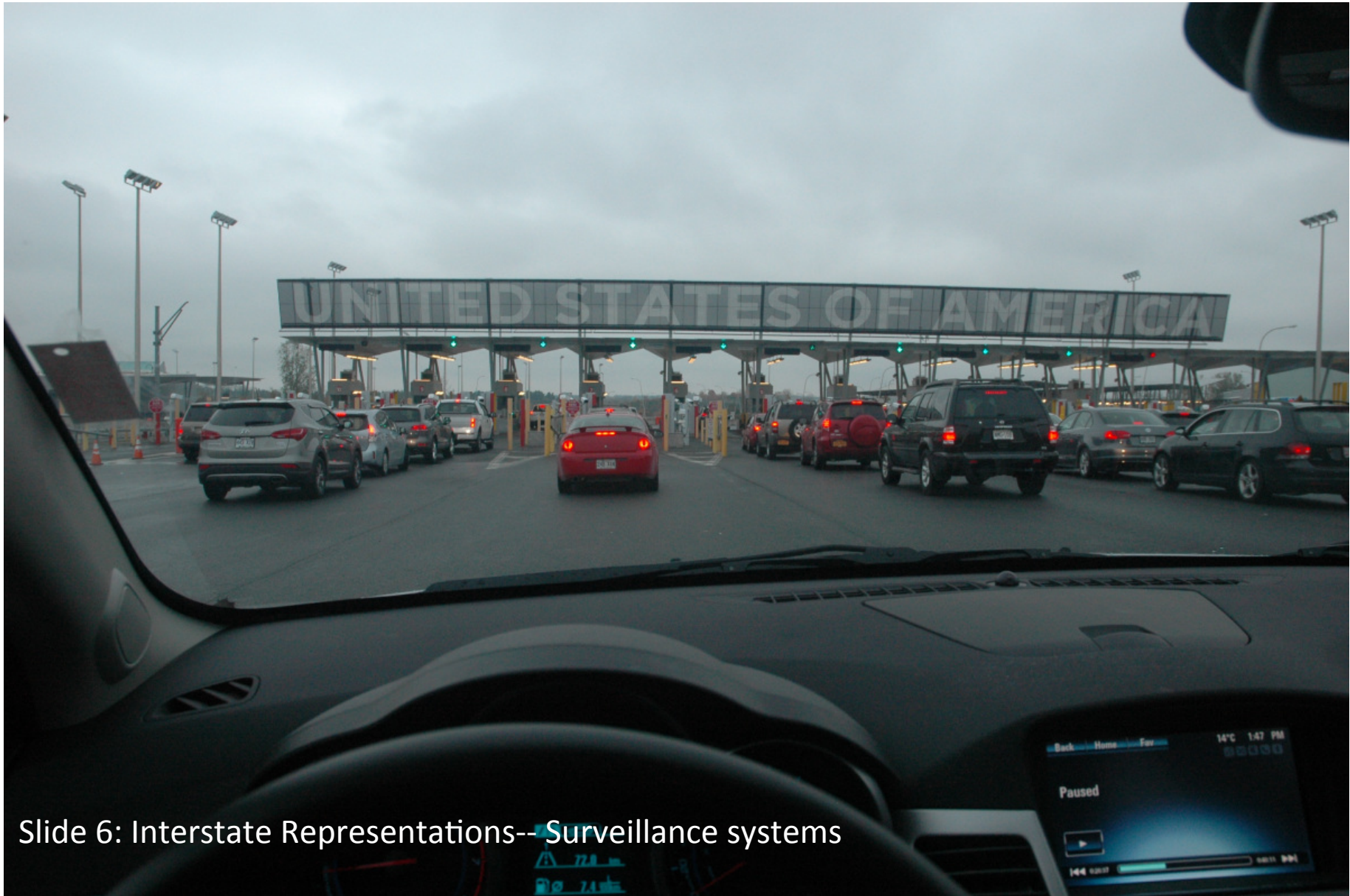
Slide 6: Interstate Representations-- Surveillance systems