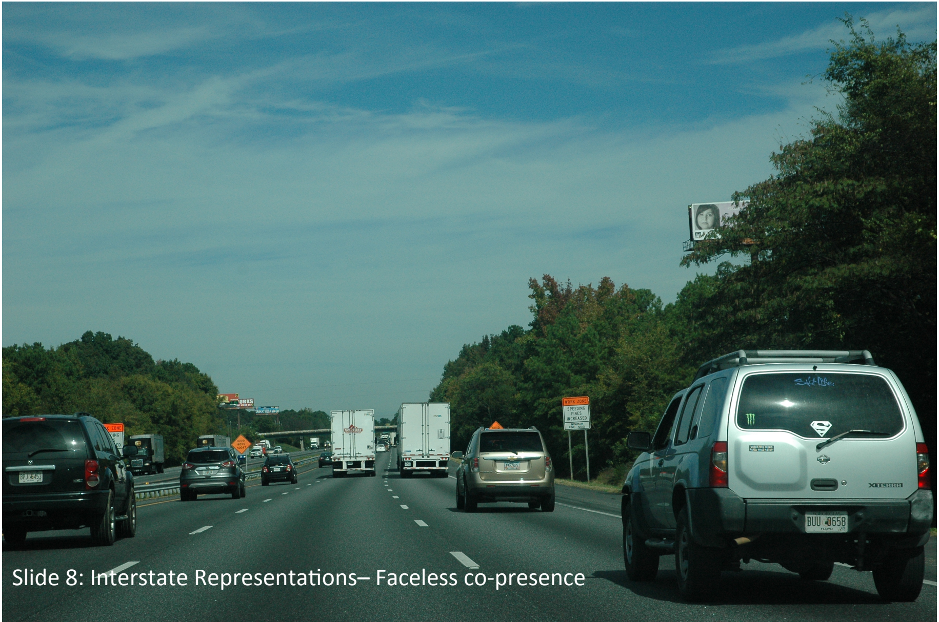
Slide 8: Interstate Representations— Faceless co-presence