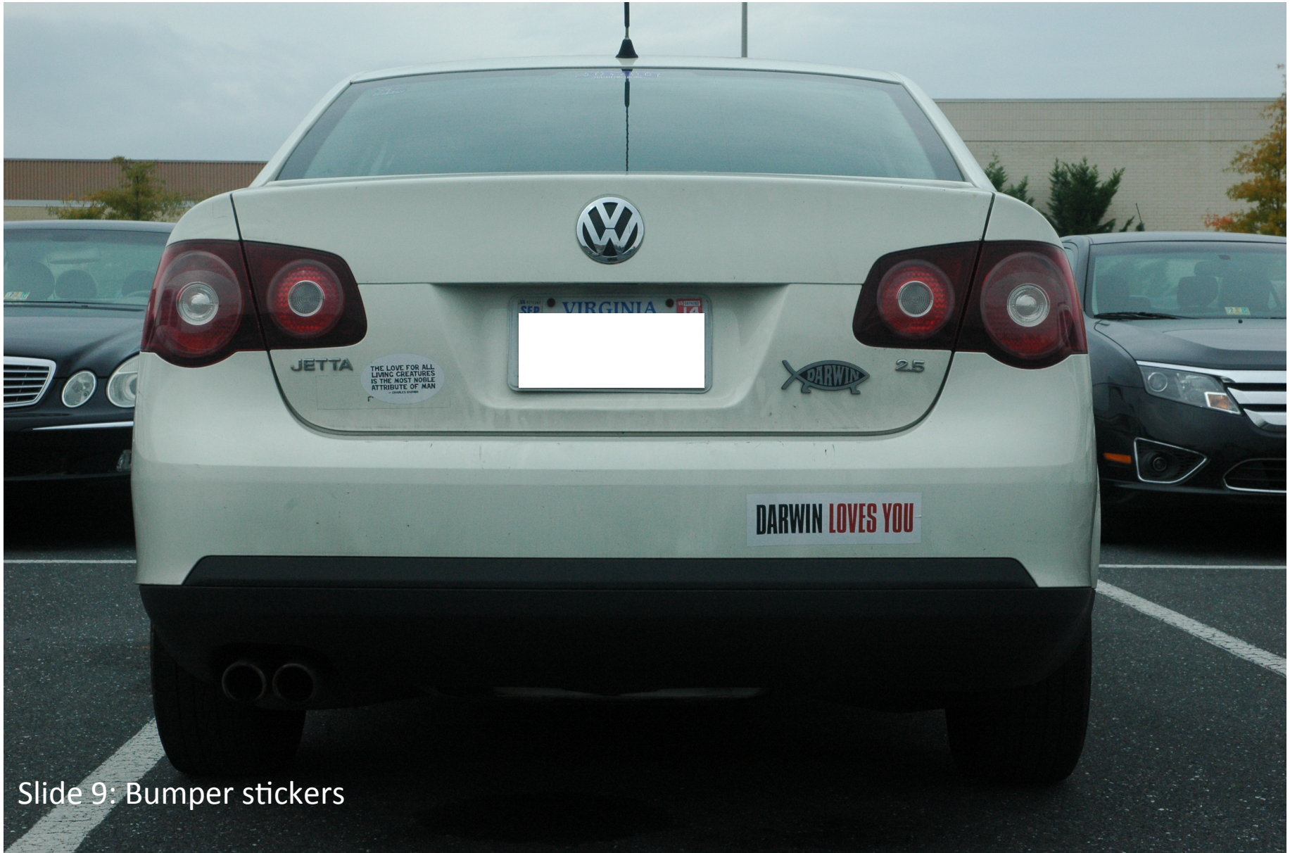
Slide 9: Bumper stickers