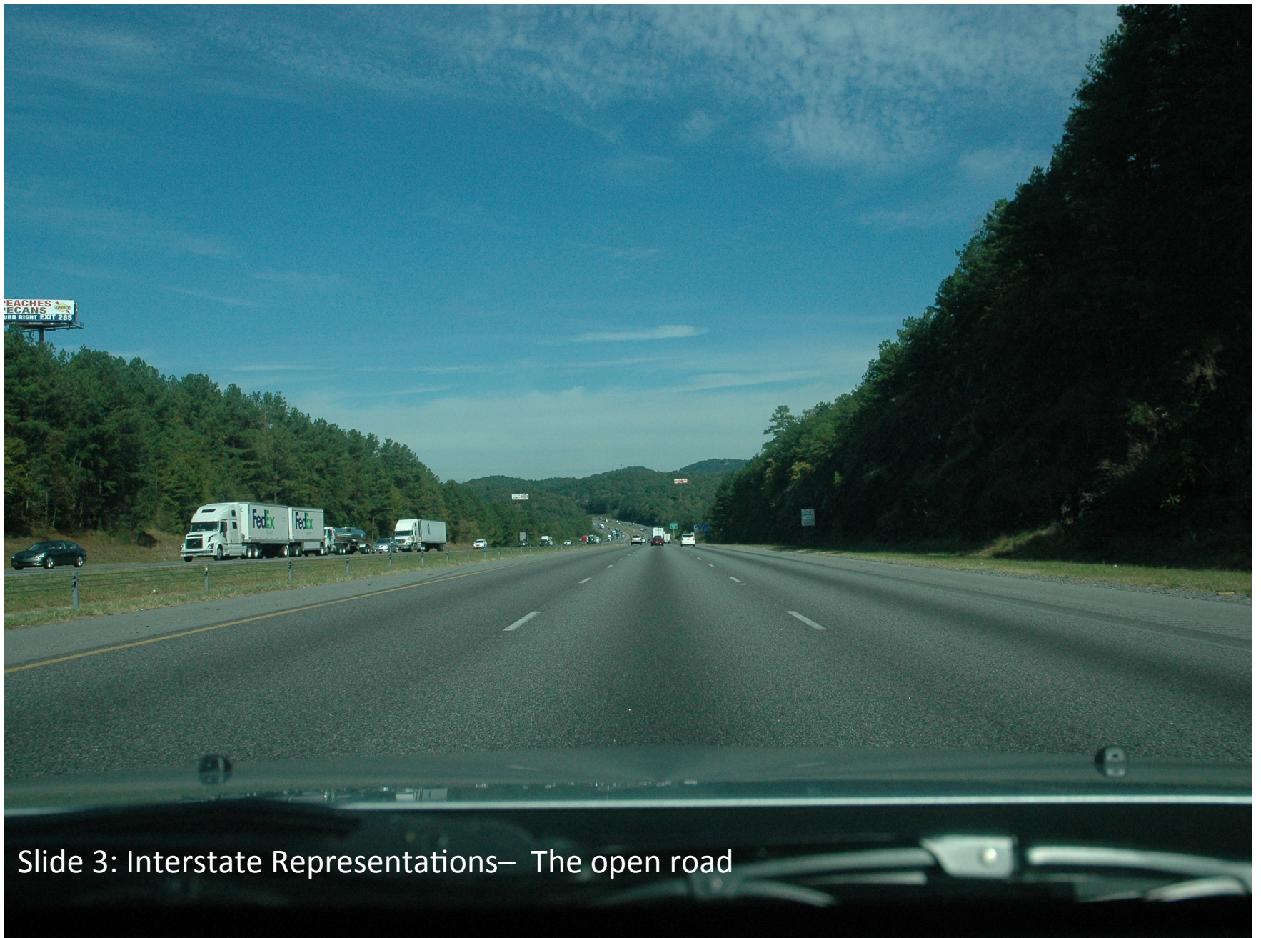
Slide 3: Interstate Representations— The open road