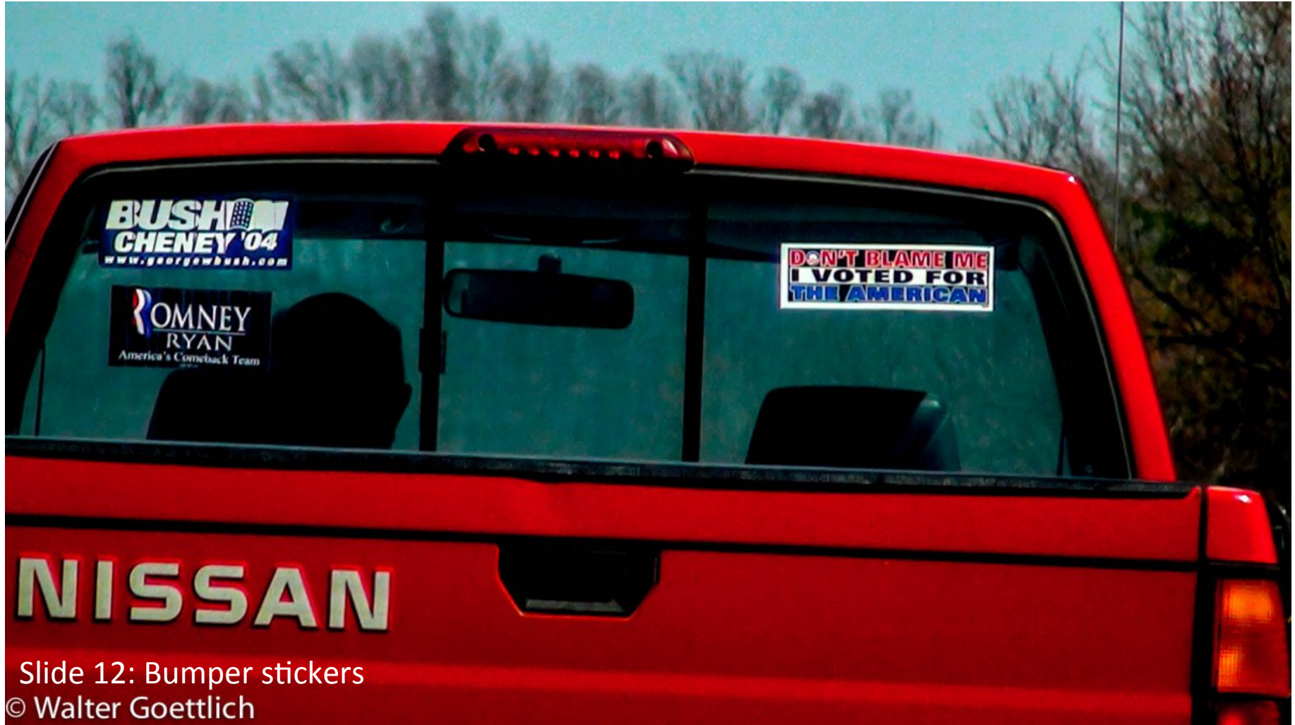
Slide 12: Bumper stickers