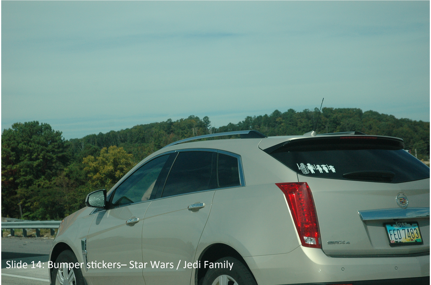
Slide 14: Bumper stickers– Star Wars / Jedi Family