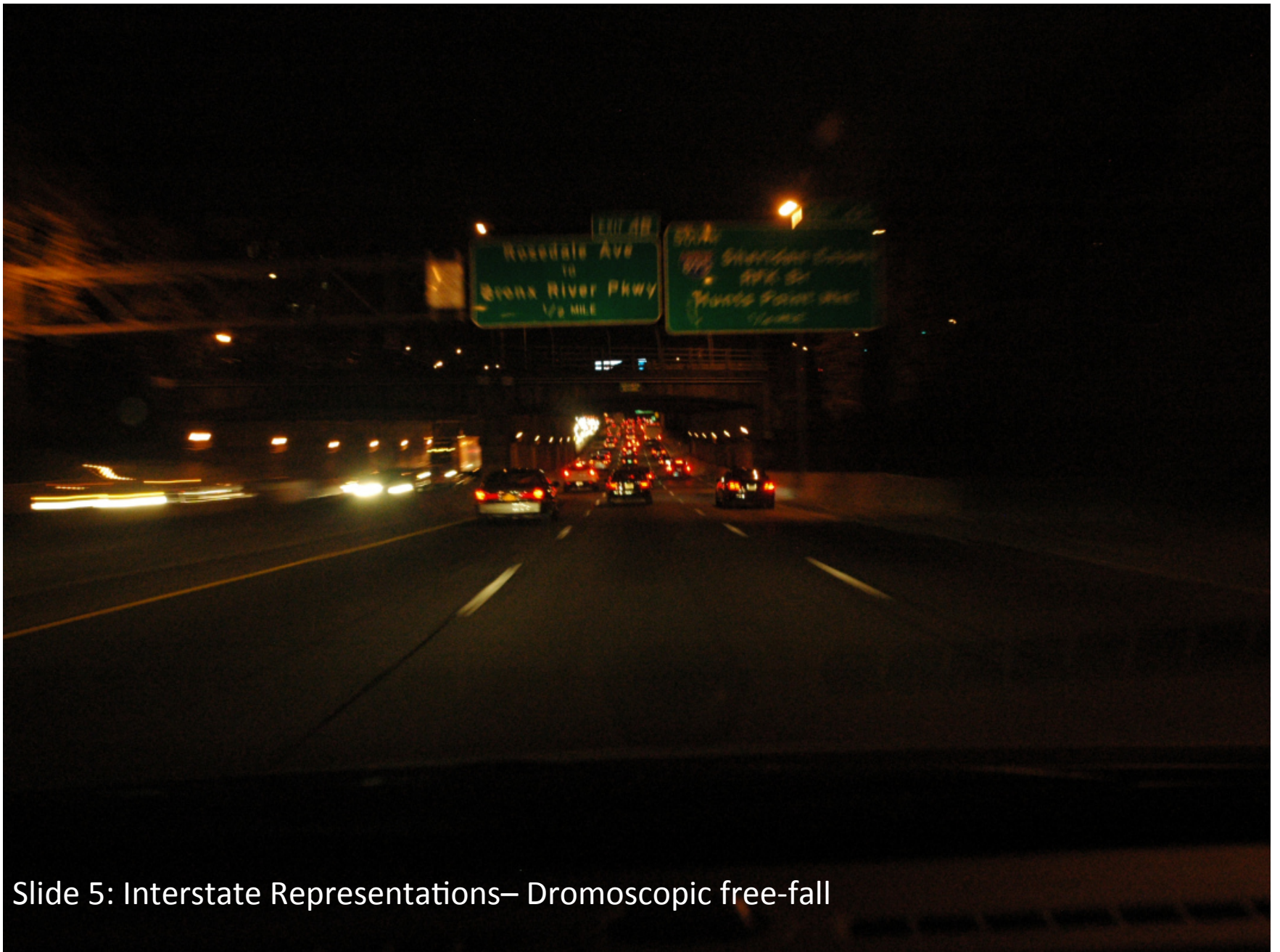
Slide 5: Interstate Representations— Dromoscopic free-fall