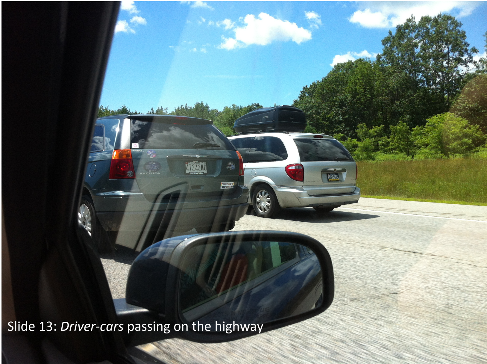
Slide 13: Driver-cars passing on the highway